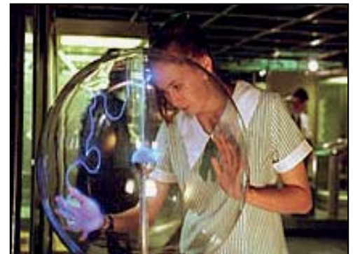
The Powerhouse Museum

Combine one of our fascinating marine films such as Under the Sea 3D with a visit to the award-winning Sydney Aquarium. The Great Barrier Reef exhibit is not to be missed!